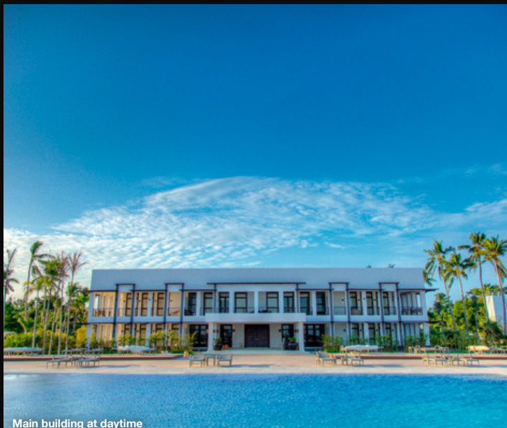
Main building at daytime