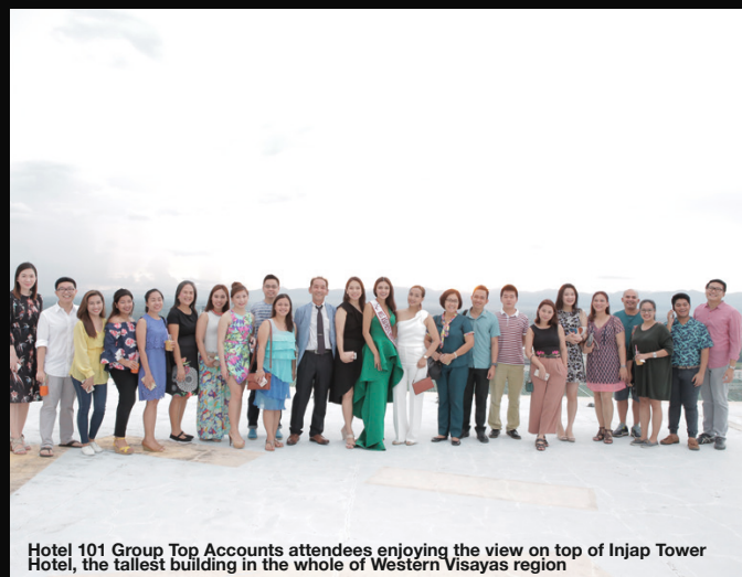
Hotel 101 Group Top Accounts attendees enjoying the view on top of Injap Tower Hotel, the tallest building in the whole of Western Visayas region